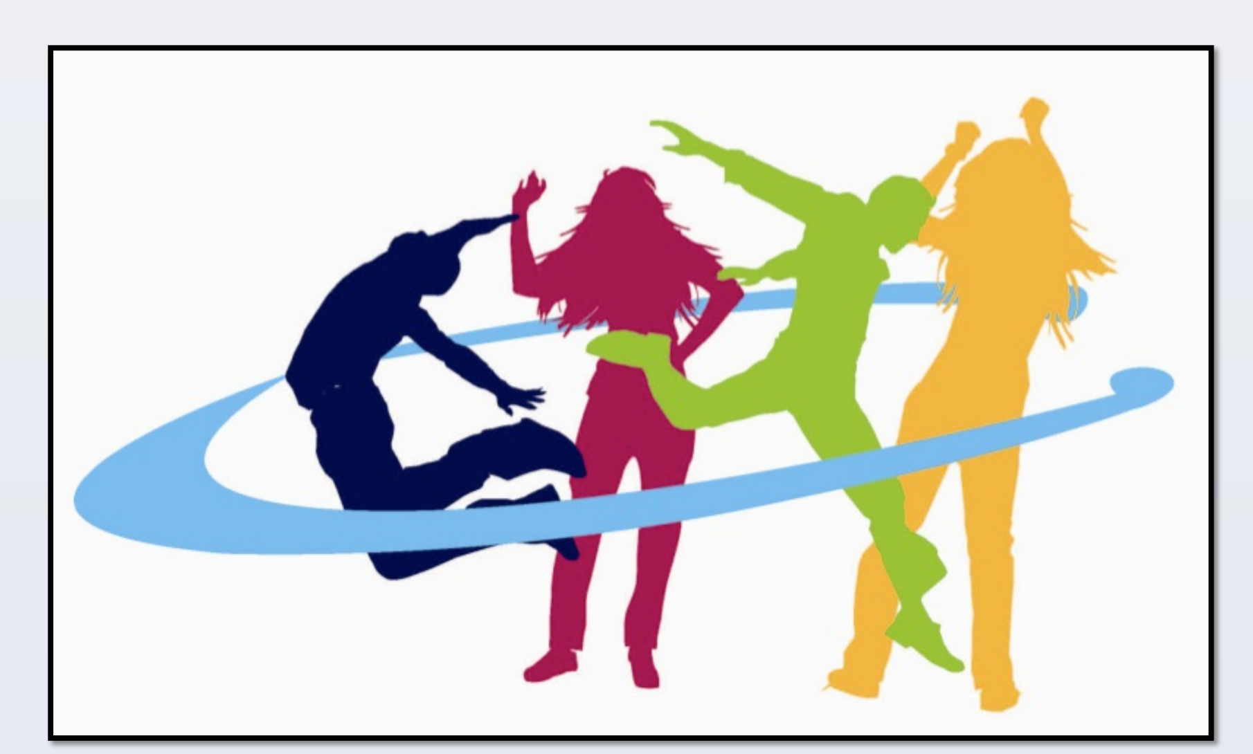
"Muévete y Métete en Cintura" program logo