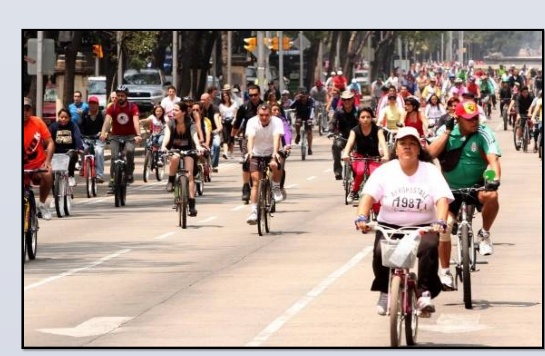
This image shows a city-wide exercise promotion event, a bicycle race through one of the main streets of the capital.