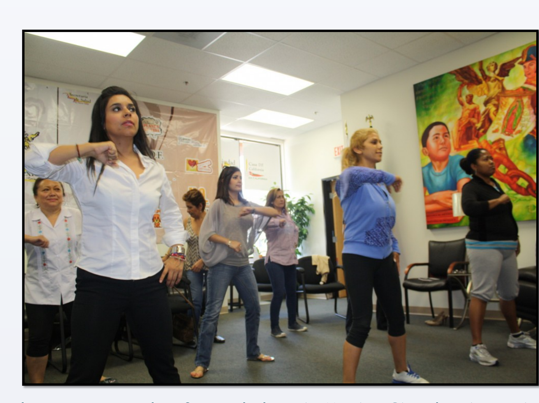
This image shows an example of a workplace in Mexico City that is participating in the "Get Moving in the Office" ("Muévete en la Oficina") intervention.

The image on the left shows a school nurse measuring the height and weight of a young student to calculate her BMI (body mass index). The image on the right shows an example of a rally sponsored by the program promoting healthy eating habits and physical activity.